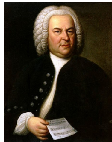
Johann Sebastian Bach

Whatever wants to happen, it emerges from our joy.